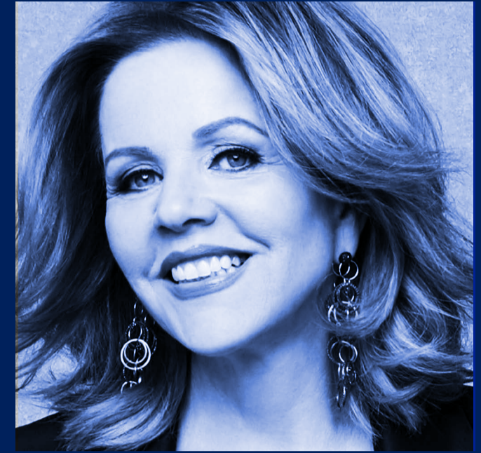
Renée Fleming Soprano