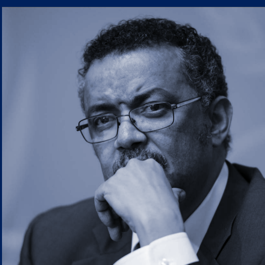
Dr Tedros Adhanom Ghebreyesus Director-General World Health Organization