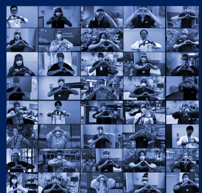
Global Scrub Choir