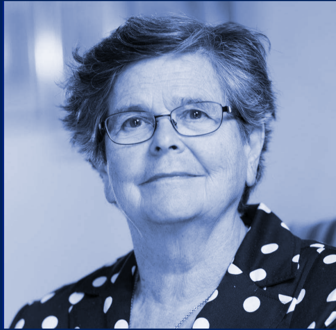
Ruth Dreifuss Former President of Switzerland