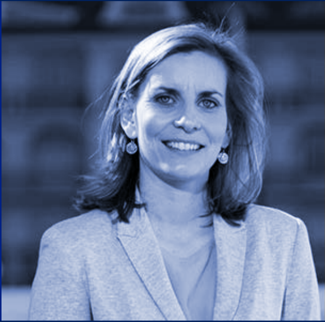
Marie Barbey-Chappuis Mayor of Geneva