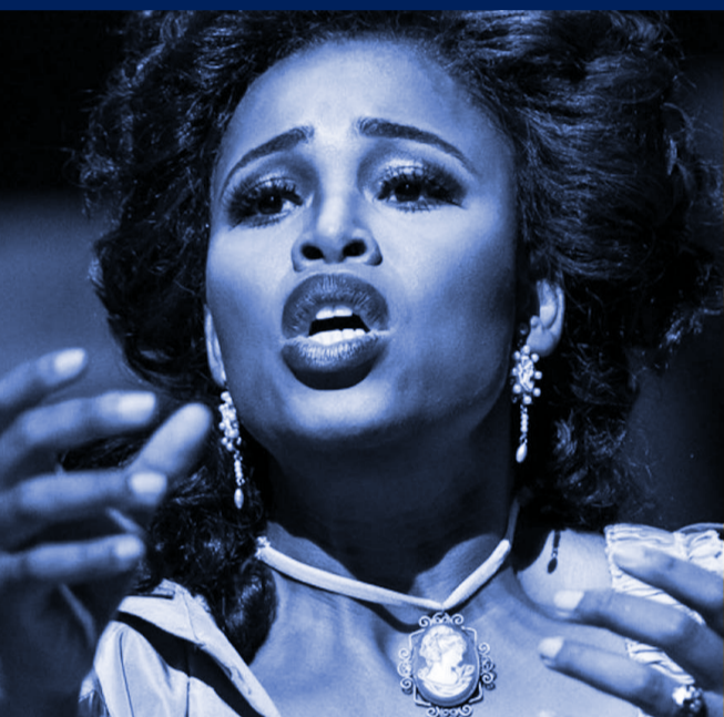
Pretty Yende Soprano