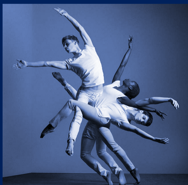
Scottish Ballet Engagement