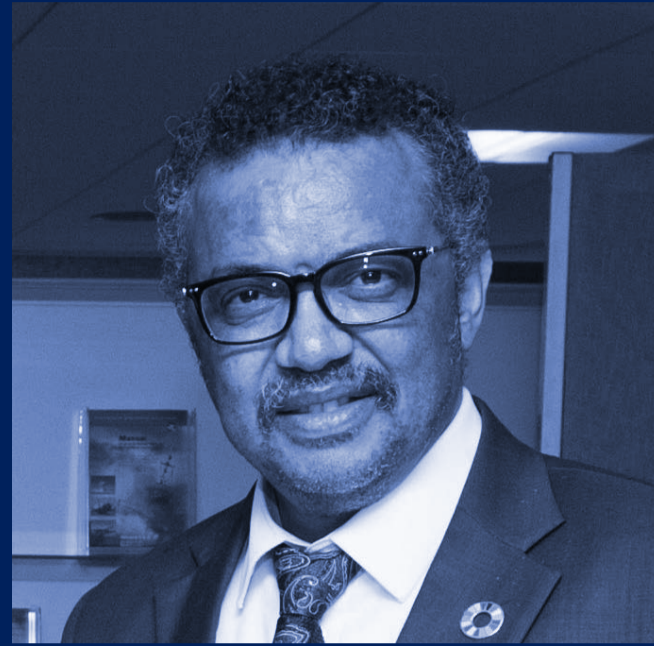
Dr. Tedros Adhanom Ghebreyesus Director-General, WHO