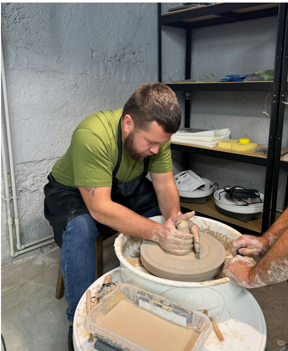
Patient making ceramics at the Unbroken Rehabilitation Center