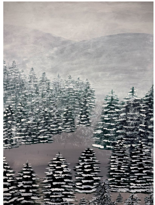
Patient painting © Unbroken