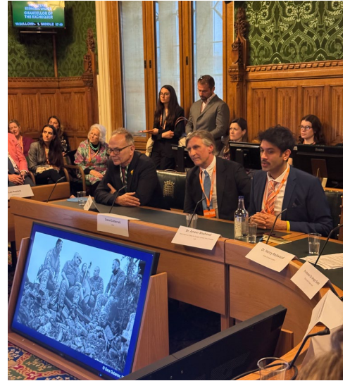
UK Parliament Roundtable