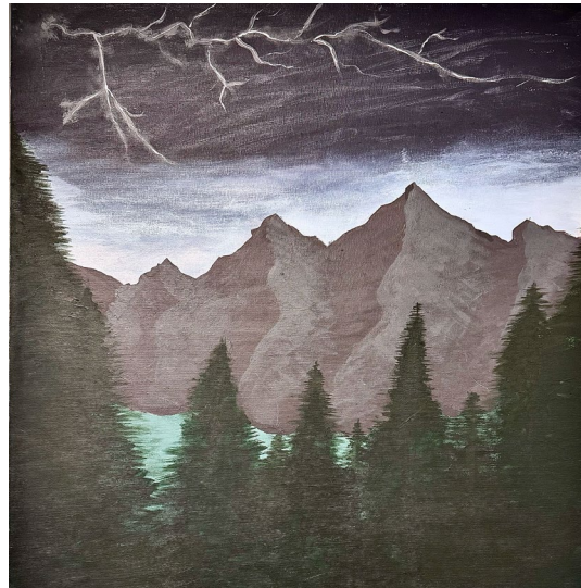
Patient Painting © Unbroken