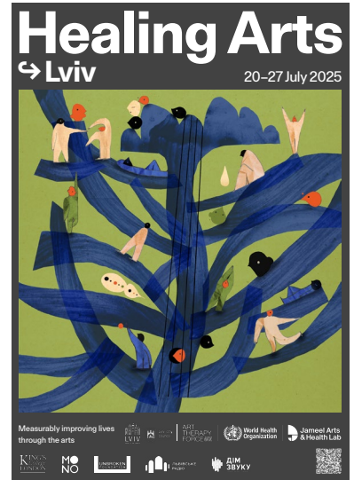
Healing Arts Poster, illustration commissioned by Art Therapy Force