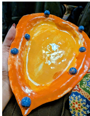
Patient ceramics © Unbroken