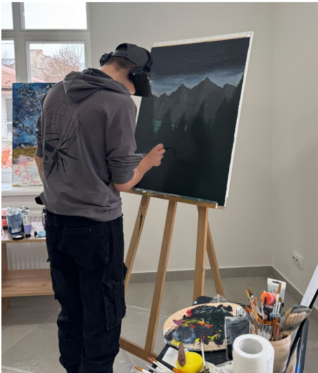
Patient painting at the Unbroken Rehabilitation Center