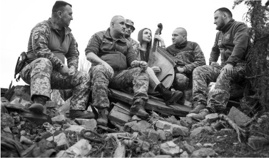
Cultural Forces project on the frontline in Ukraine