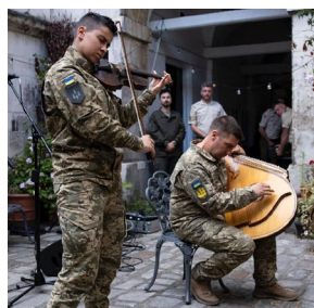
Soldier performing © Cultural Forces