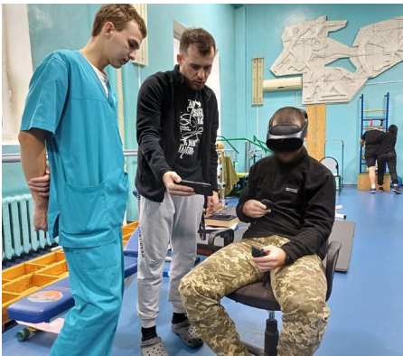
VR project at the Unbroken Rehabilitation Center

The numbers of mental health professionals required to address such a demand in the ways currently outlined in NICE guidance are too great and even then, those therapies do not lead to significant recovery in almost half of those willing to embrace them.